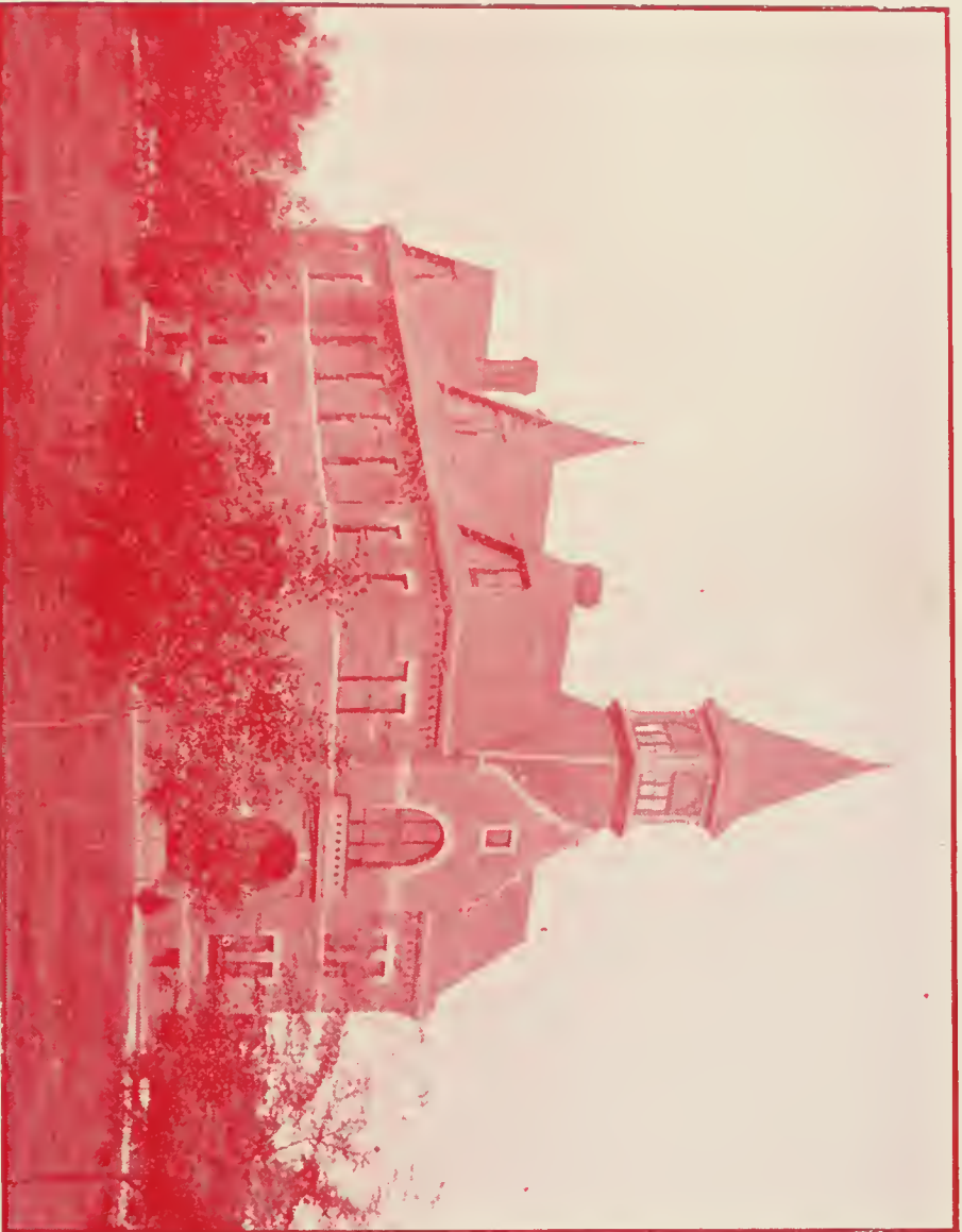
Republic County Court House, Belleville, Kansas.